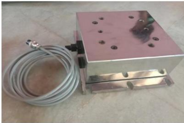
Figure 2: V-TECH Grinding Tool Dynamometer- Model 220B sensor

The dynamometer uses strain gauges to measure the cutting forces. A particular full bridge strain gauge connection have been employed for all orthogonal directions of the three forces inside the dynamometer. The outputs of these strain gauge bridges are available via the 12-pin connector sockets on the sensor body. The picture of the V-TECH Grinding Tool Dynamometer is shown in figure (2) below.