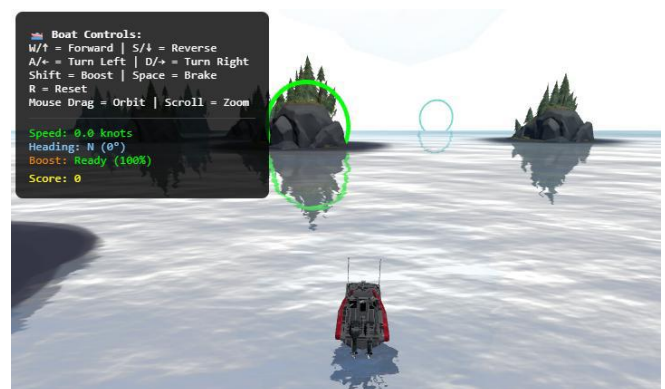
Figure 2: Tools and Technologies Used in 3D Modeling

Various 3D modeling software applications are available for creating digital objects. These tools provide features such as object shaping, surface editing, animation support, and rendering options. Some software is mainly used for industrial and engineering design, while others are suitable for animation, gaming, and educational purposes. Such applications allow users to build models with precision and modify them according to project needs.