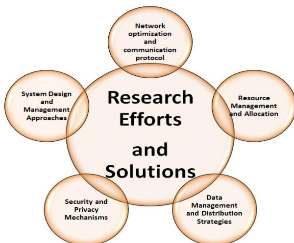
Figure 5: Research efforts and solutions in the field of fog and edge computing

The process of combining edge and fog resources with cloud services requires effective communication protocols and methods. The system needs to create methods which will handle data processing by first selecting important information before sending it to the cloud. The system should delay sending data to the cloud until necessary. The system should first process important data while handling less important information through local processing to achieve better bandwidth management and lower latency times [34]. Researchers are developing hybrid communication protocols which will enable data synchronization and workload sharing