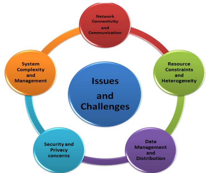
Figure 4: Issues and Challenges of Fog and Edge Computing

As an emerging technology, fog and edge computing aim to address the challenges faced by the large volume of data and increasing demand in real time processing due to IoT, 5G services and other interconnected technologies. While these emerging technology offering numerous advantages, but there are also several issues and challenges associated with their implementation, which is shown in Figure 4.