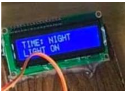
Figure 4: LCD Display Output

The LCD display was used to provide local monitoring of system operation.