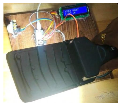
Figure 3: Street Light Operation Result

The automatic control feature was tested under different lighting conditions.