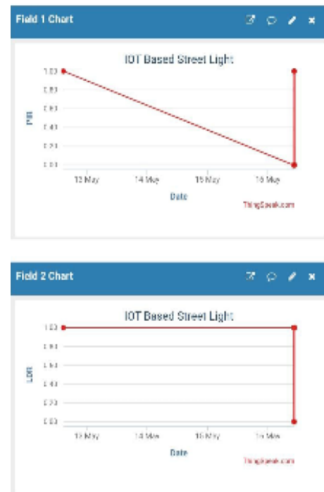
Figure 5: IoT Dashboard Screenshot

The developed system was integrated with IoT functionality using ESP32 Wi-Fi communication.